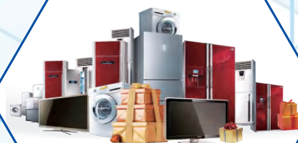
Household electric appliances